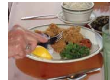
Original Oyster House, Gulf Shores