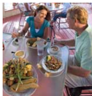
Ed's Seafood Shed, Spanish Fort

Camden Black Bottom pie at GainesRidge Dinner Club , 334-682-9707