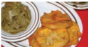
Ironton Cafe, Ironton

BBQ & baked beans at Golden Rule Bar-B-Q (1891), 205-956-2678 Fried green tomatoes at the Ironton Cafe (1928), 205-956-5258