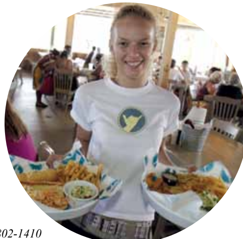
The Hangout, Gulf Shores

Fort Deposit Pecan Fruit Cake & pralines at Priester's Pecans , 334-227-4301