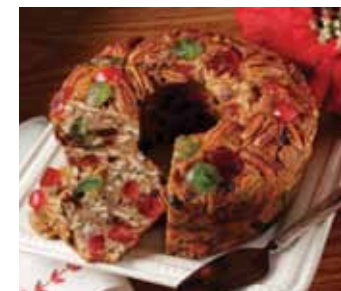
Priester's, Fort Deposit

Fyffe Buffet & BBQ at Barry's Backyard Barbecue , 256-623-2102