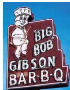
Big Bob Gibson, Decatur

Daphne Shrimp Po-Boy at Market By The Bay , 251-621-9994