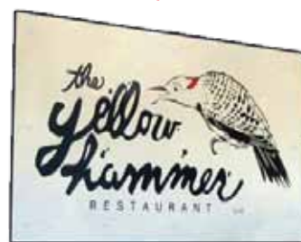
Yellow Hammer, Waverly

Baked Turkey Wings at Larkin's Deli , 205-932-9988