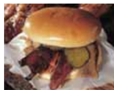
Bob Sykes BarB-Q, Bessemer

Birmingham Buttermilk fried chicken with lemon basil sauce at Cafe Dupont , 205-322-1282 Cheese biscuits at Jim 'n Nick's Bar-B-Q , 205-320-1060 Gourmet pizza at Cosmo's , 205-930-9971 "Half-Moon Cookies" & marinated cole slaw at Full Moon Bar-B-Que , 205-324-1007 Hamburger & sweet tea at Milo's , 205-326-6456 Highlands baked grits at Highlands Bar & Grill , 205-939-1400 "Honey's Pies" at Baby Ray's , 205-945-7437 ● Hot dog at Pete's Famous Hot Dogs (1915), 205-252-2905 Lobster Pot Pie at Ocean , 205-933-0999 ● Onion rings at Lloyd's (1937), 205-991-5530 Neopolitan pizzas at Bettola , 205-731-6499 Parmesan souffle at Bottega , 205-939-1000 Pastries at Chez Fonfon , 205-939-3221 Tomato salad & pickled okra at Hot and Hot Fish Club , 205-933-5474 Vegetable buffet at Niki's West , 205-252-5751 Vine-ripe tomatoes with Parmesan flan at Fire , 205-802-1410