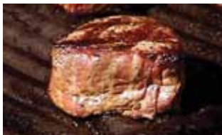
George's Steak Pit, Sheffield

Crab cakes at Fox Valley Restaurant , 205-664-8341