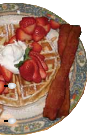
Columbus Street Inn, Fayette

Auburn Crab cake & avocado sandwich at Amsterdam Cafe , 334-826-8181 ● Fresh lemonade at Toomer's Drugs (1896), 334-887-3488 "Momma's Love" sandwich at Momma Goldberg's , 334-821-0185